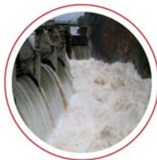
DAMS AND RESERVOIRS

Zenzele Valves Supply locally Manufactured valves according to all national and international standards such as ISO, SANS, CEN, DIN, NF, BS, GB, AWWA, JWWA, AS, and GOST. Resilient seated mainline gate valves are supplied from DN 40 up to and including DN 800. Metal seated gate valves are supplied up to and including DN 3000. Further, a range of control valves, check valves, and discharge valves are produced for dams, reservoirs, and large diameter transmission pipelines by the well-known company Premier Valves (Pty)Ltd. Zenzele supplies a wide range of butterfly valves in double eccentric, centric, vulcanized and loose liner design. We also locally manufacture a range of open Spur gearboxes for gate valves and butterfly valves.